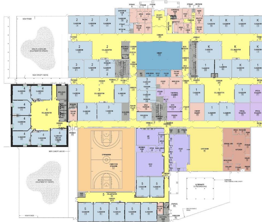
NEW COMPOSITE FLOOR PLAN