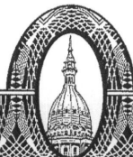
Rick Snyder Governor