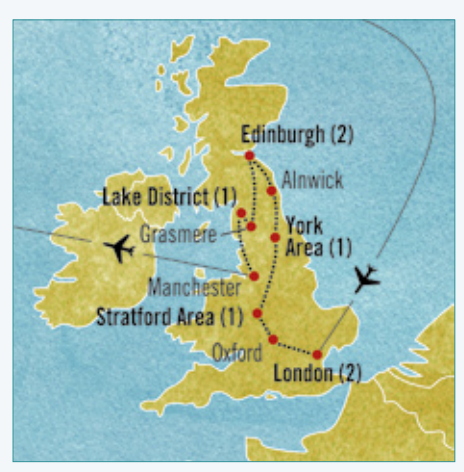
* Map may not reflect your final trip itinerary.