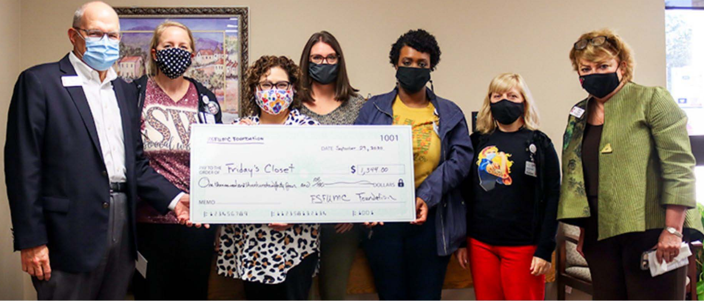
FIRST UNITED METHODIST GRANT FOR FSPS SOCIAL WORKERS