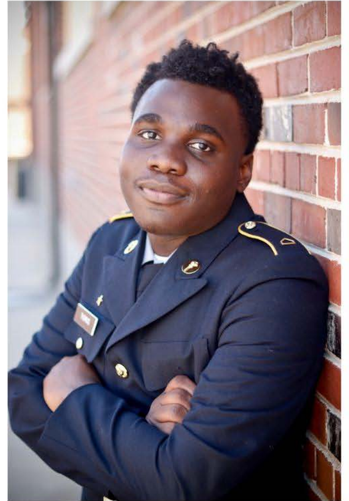
Senior, Northside High School