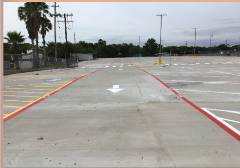
A.C. Jones -Stadium Parking Lot_05.21.2018