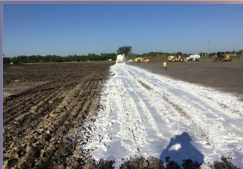
Moreno JHS - Lime Stabilization_05.21.2018