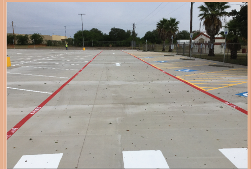
A.C. Jones -Stadium Parking Lot_05.21.2018