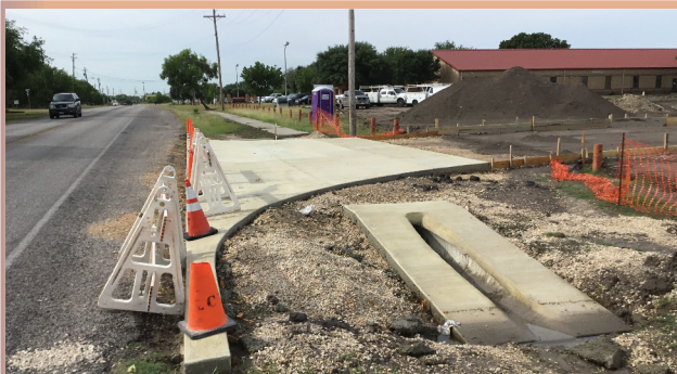
Moreno JHS - New Drive Approach _05.21.2018