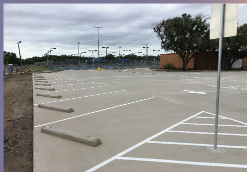
A.C. Jones - West Parking Lot _05.21.2018