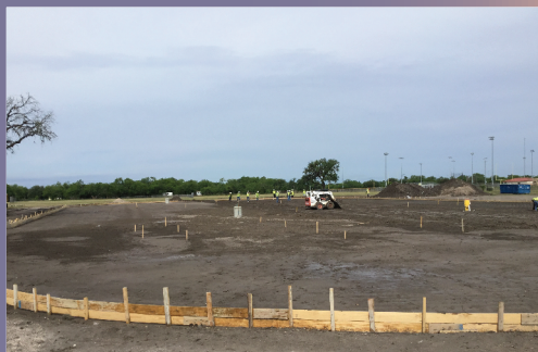
Moreno JHS - Parking Lot _05.21.2018