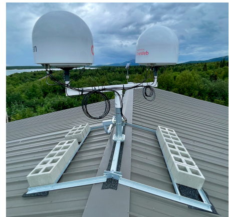
OneWeb terminal, to be removed