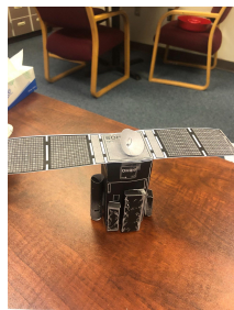
7th Grade Science-Buiding a Spacecraft