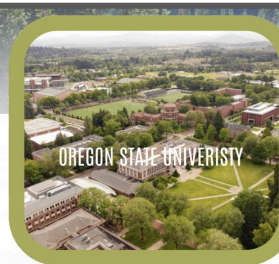
OREGON STATE UNIVERSITY