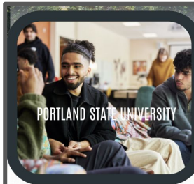
PORTLAND STATE UNIVERSITY

Fun activities and challenges that build leadership, team-building, resilience, and other life skills!