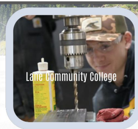
Lane Community College