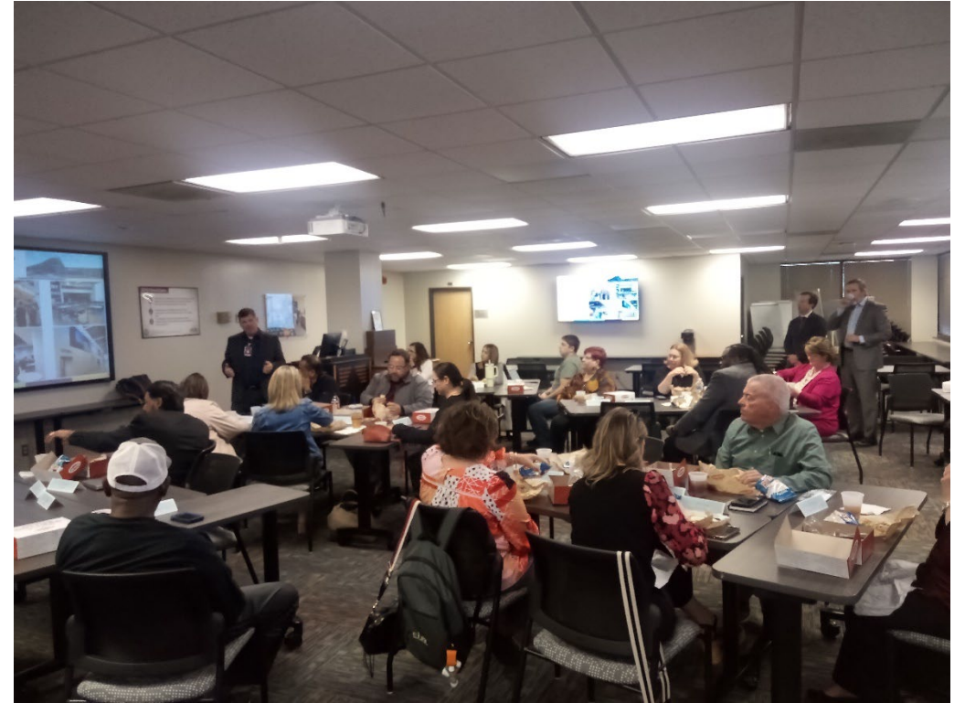
Planning Committee Meeting with PBK