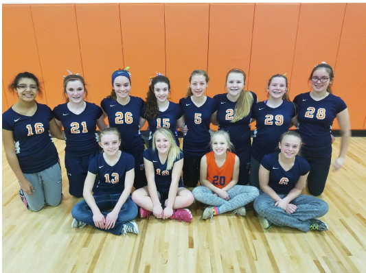
The 8th grade Girls' Volleyball team celebrated 8th Grade Night at the last home game on February 16th.

The poverty simulation at the Teacher Workshop on Friday, February 17th was an insightful experience for students and staff. There was much conversation regarding the realities of what many of our staff and students face each day. We will continue to work to address those needs to assist in the success of kids at school.