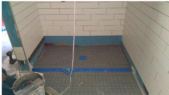
New Shower Area

Panther Hall Renovations, 75% designs have been reviewed and the HVAC testing report is being reviewed $34,620