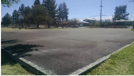
New Asphalt Court