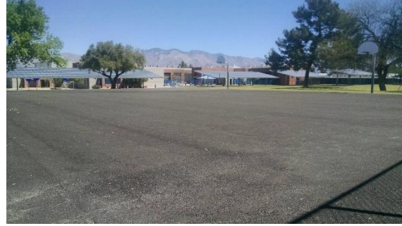
Ready for striping