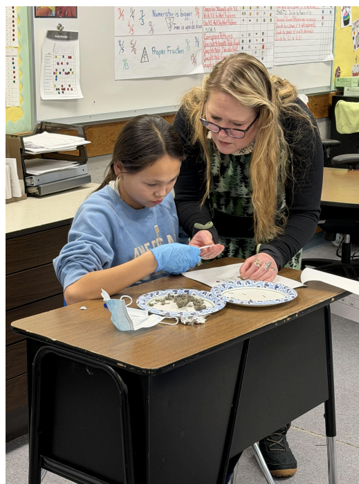
Level 5-6 dissecting owl pellets to discover what the owls have eaten.