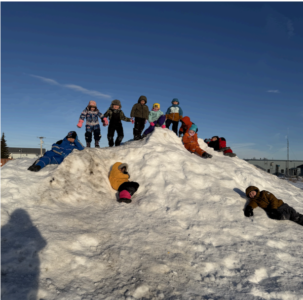
First/ second grade spending time outside after the harsh temperatures passed.