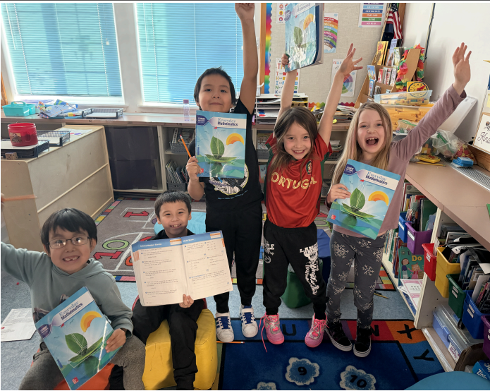
Second grade celebrating the completion of their first math journal and getting ready to start their second one!!