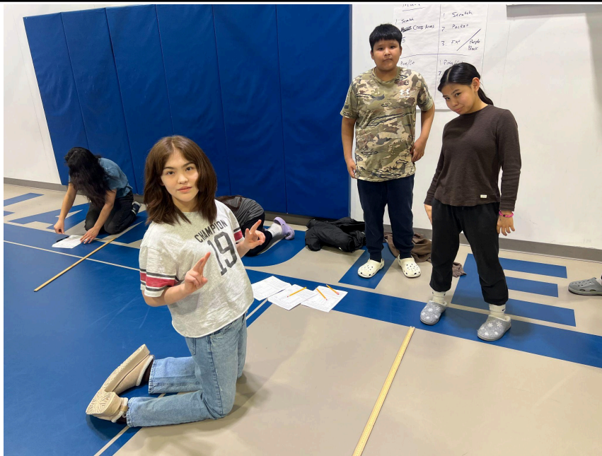
Middle school science collecting data to see how far they could jump on different planets where there are different amounts of gravity.