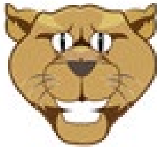
Beatrice Martinez Cavazos Elementary