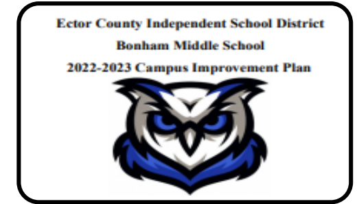
Campus Improvement Plan