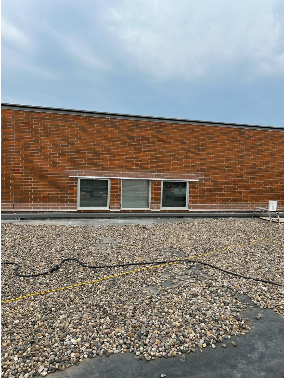
Completed Through Wall Flashing Installation (Green Area)