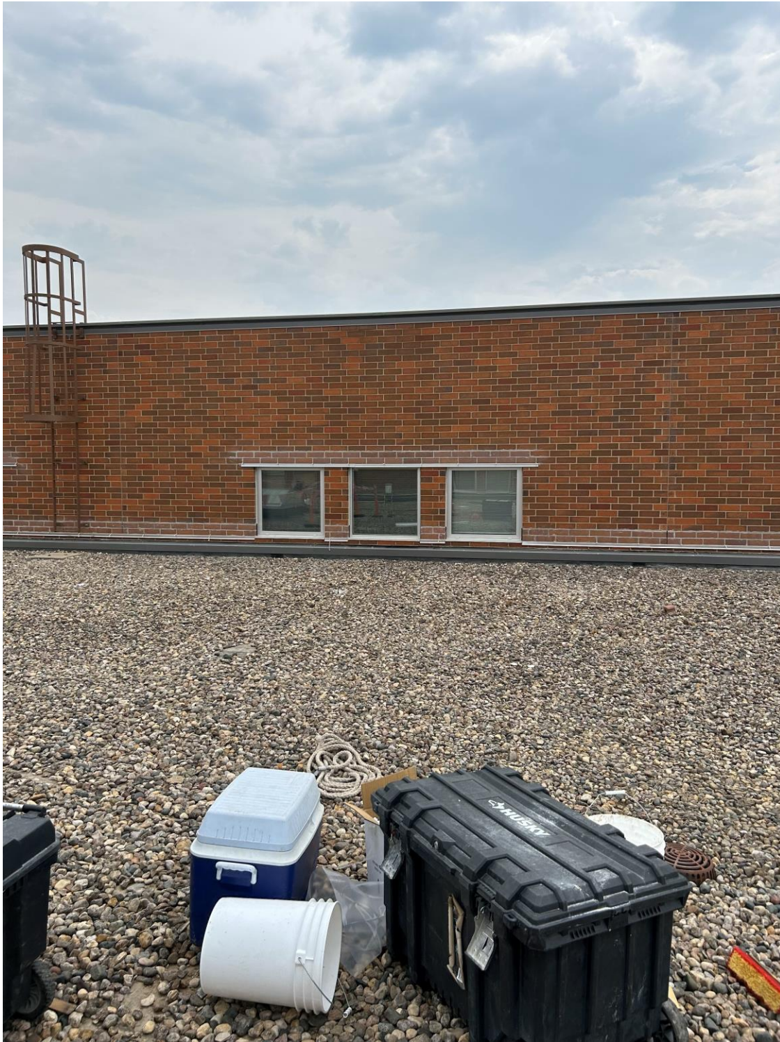
Completed Through Wall Flashing (Green Area)