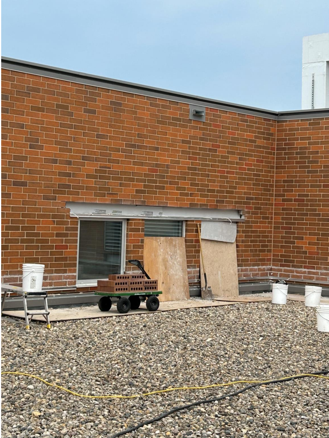
Through Wall Flashing Installation in Progress above windows (Green Area)