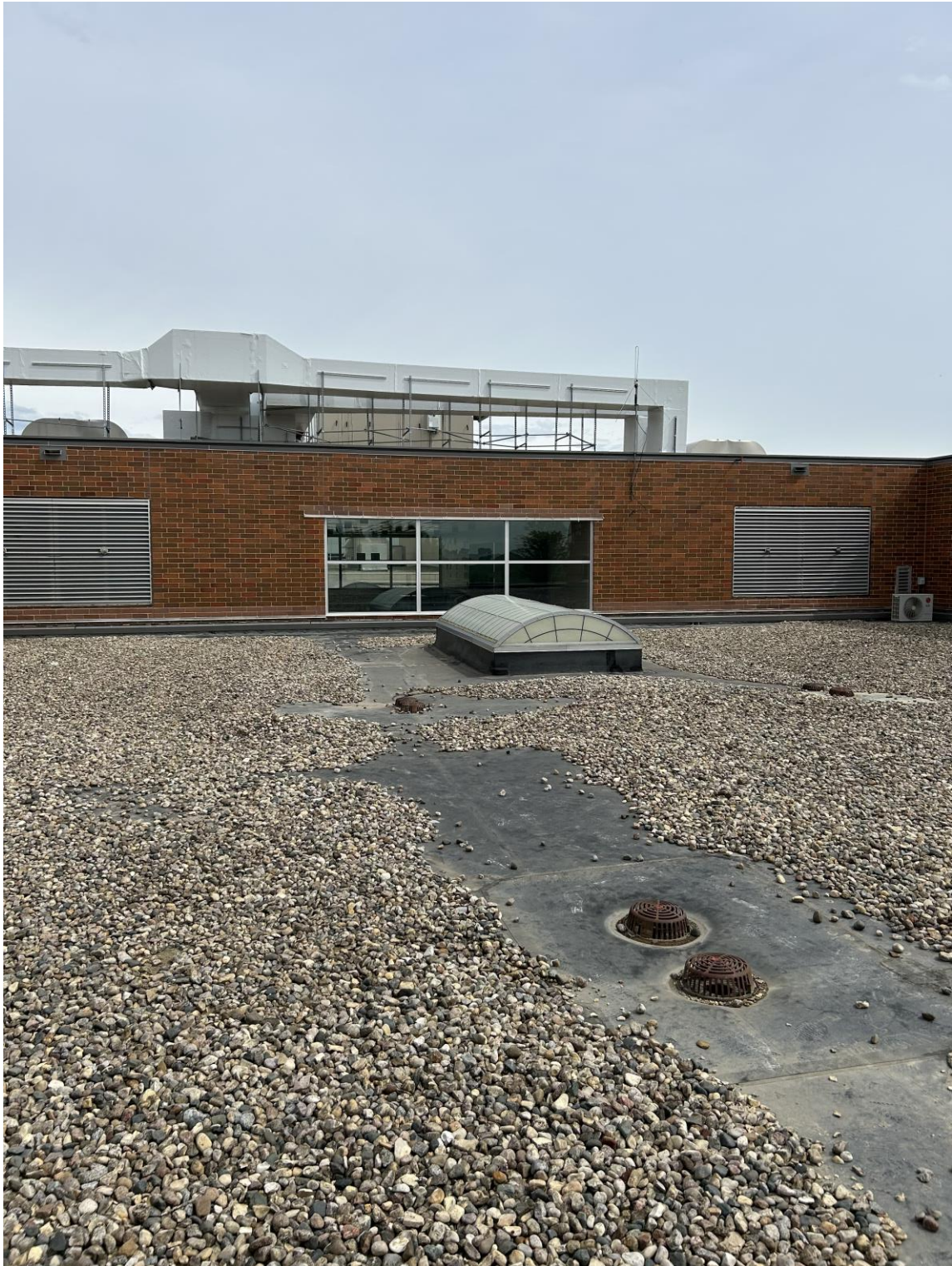
Completed Through Wall Flashing (Green Area)