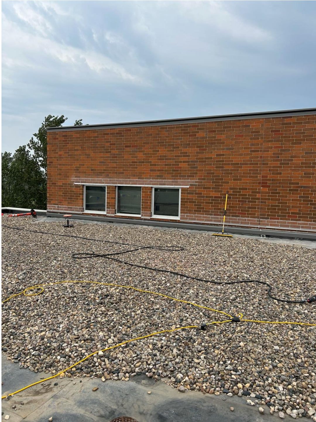
Completed Through Wall Flashing (Green Area)