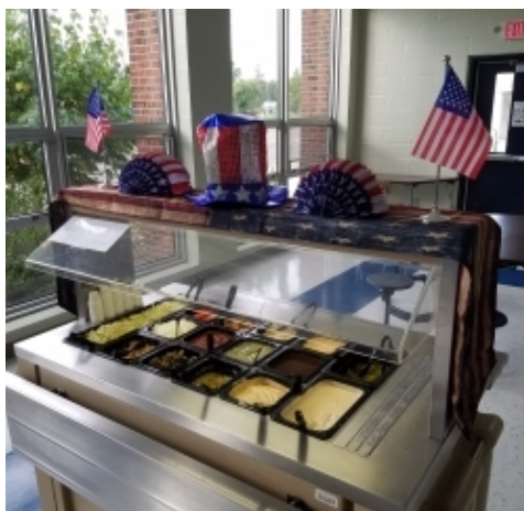
All American Bar