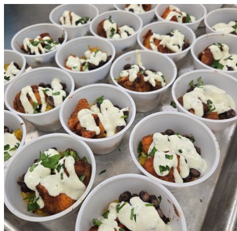
So Good Sampling