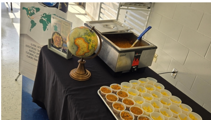
Global Bites France