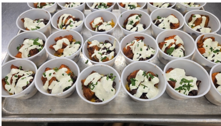
Sweet Potato Rice Bowl w/ Cilantro Lime Crema