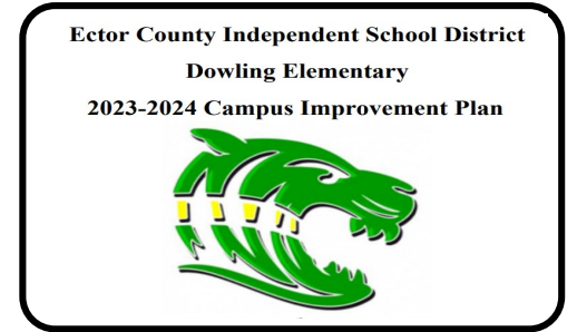
Campus Improvement Plan