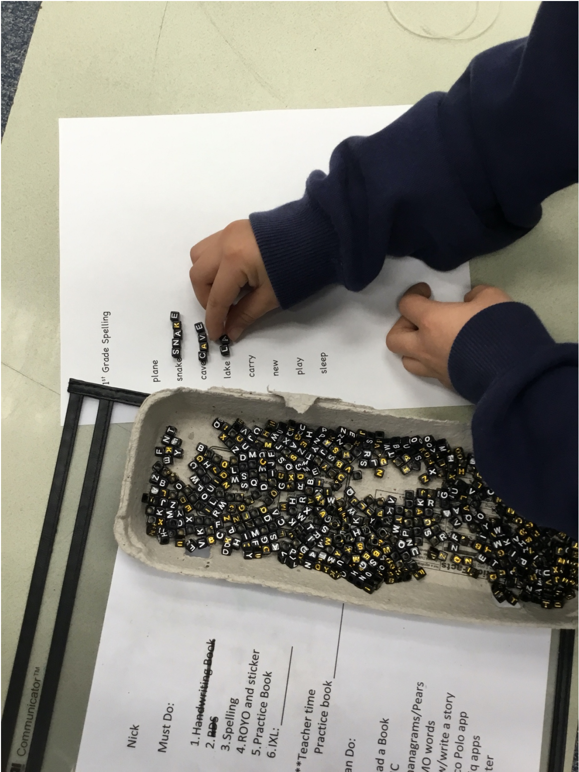
Spelling fun with beads.