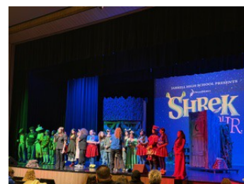
Seniors in the Shrek Production