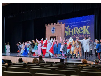
Musical Cast for Shrek