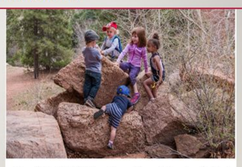
Between 2016 and 2017, the U.S. saw a 66 percent increase in the number of registered outdoor preschools and kindergartens. Here, a group of preschoolers turn a series of boulders into a make-believe world.

All children and families can benefit from time spent in nature.