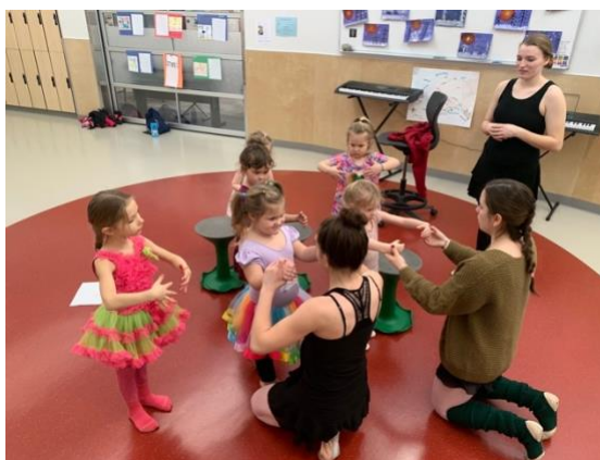
Three HS girls share their love of ballet with the little ones