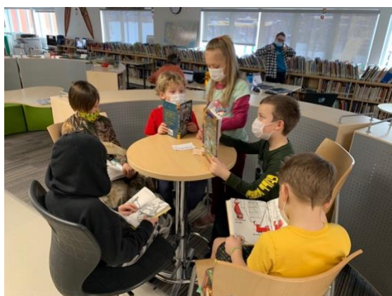
Reading cohort in the Library