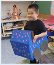
Not Just a Box

Photos: Chignik Lagoon, Chignik Lake, Kokhanok, Tanalian, Perryville, Newhalen