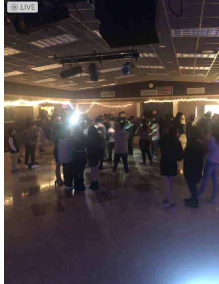
AK Star Dance and Music Production class performance: