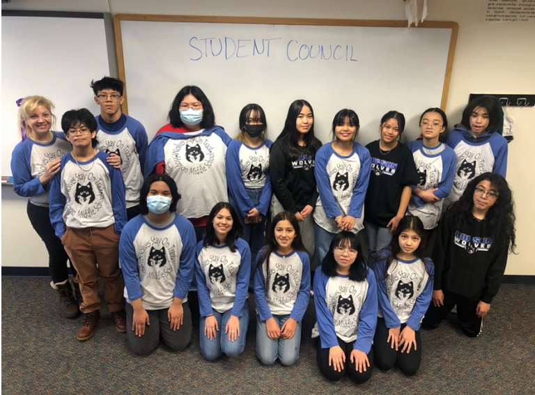
Student council visits Ilisagvik and Central Office: