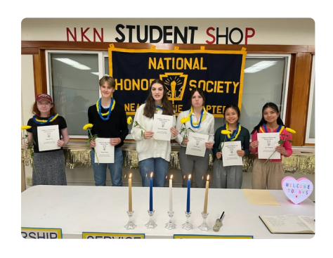
The New Inductees