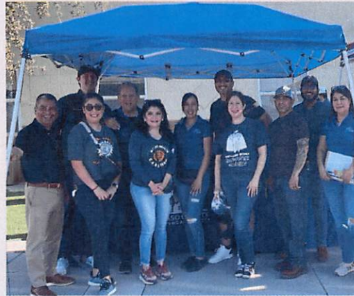
West Location July 13, 2024