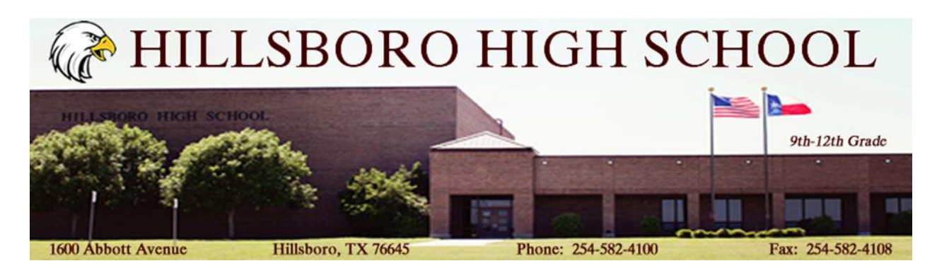
Hillsboro High School Board Report - June 2019