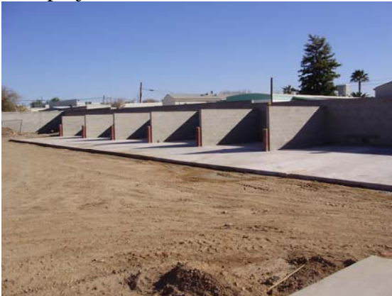
Exterior storage bins

A. Facility Support Services Center : Construction is 82% complete. Exterior concrete and paving, interior shops finish mechanical connections, and interior office finishes are in process. The new FSS project was scheduled so FSS could be relocated and the existing FSS facility could be repurposed for Transportation Department use. Procurement of design services for the current FSS building repurposing to Transportation offices is underway. This project is ahead of schedule and on budget.