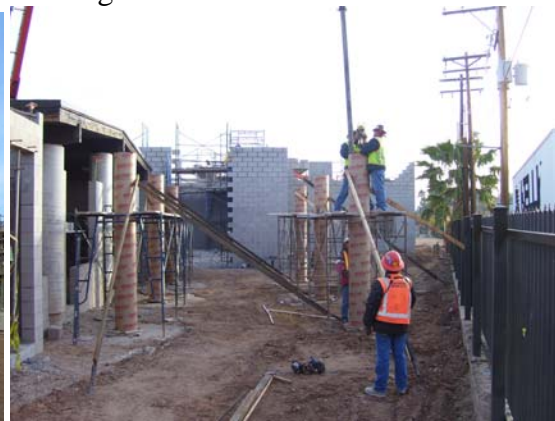
Concrete and Masonry Work

C. CDO Theater Updates: Construction is complete. This project was completed ahead of schedule and on budget.