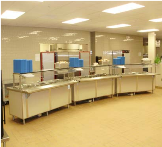
New Serving Line