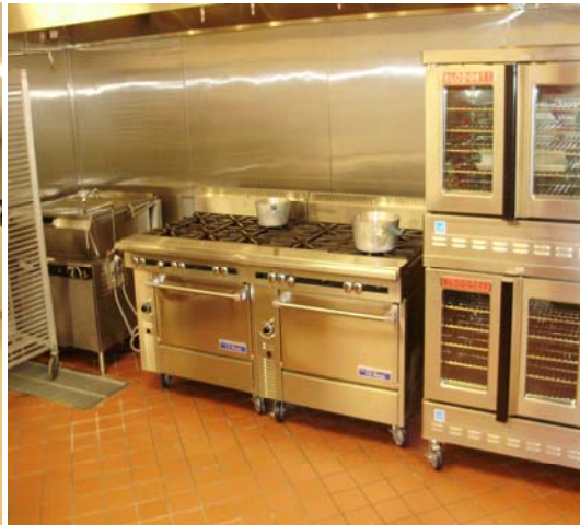
New Cook Line