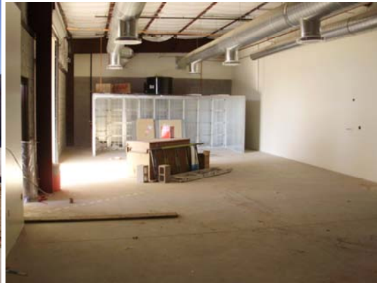
Paint booth installation

B. El Hogar / Land Lab : The security fence around El Hogar is complete.