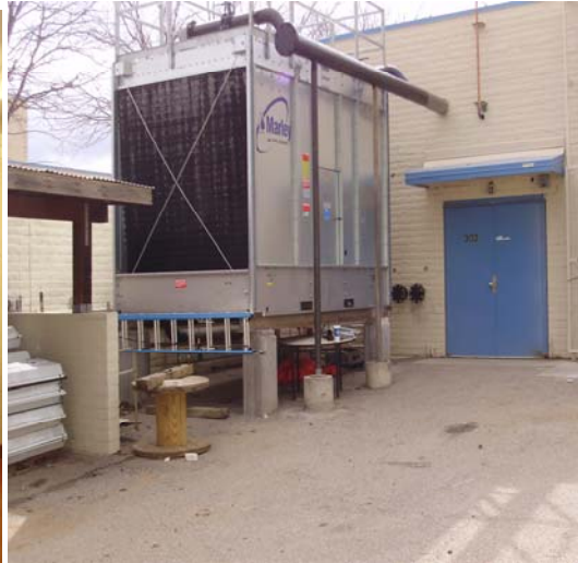
New cooling tower

B. Rillito Center Addition: Construction is 35% complete. All exterior CMU walls are complete and steel roof joists and roof decking are being installed.