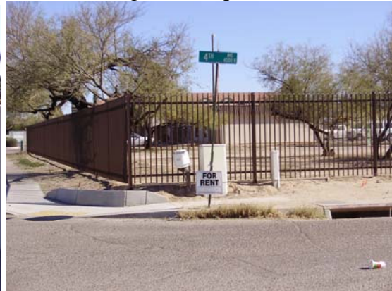
Wrought Iron Fence