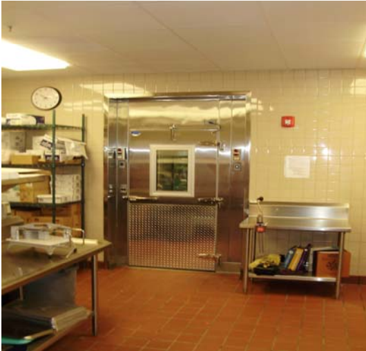
New Walk-in Cooler / Freezer