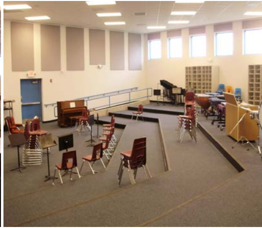
New Band Room