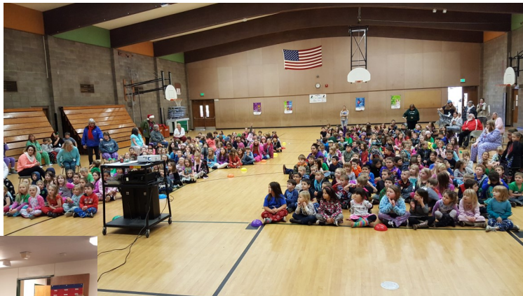
Our two birthday girls