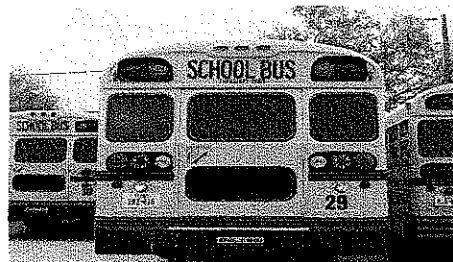
77 passenger bus