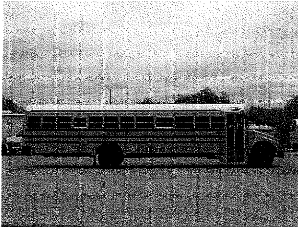
77 passenger bus