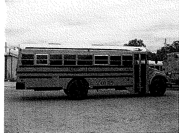
47 passenger bus