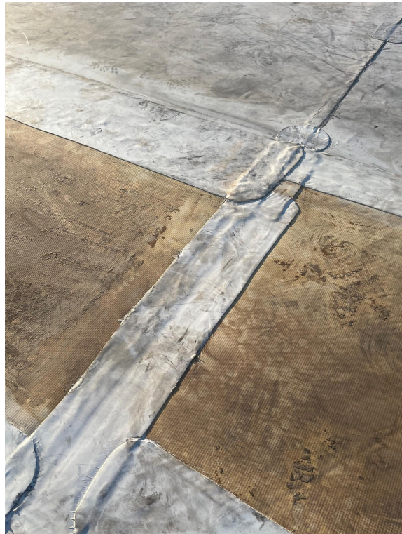
Bielefeld roof ^ →