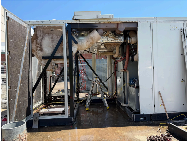
Middletown High School fuel cell