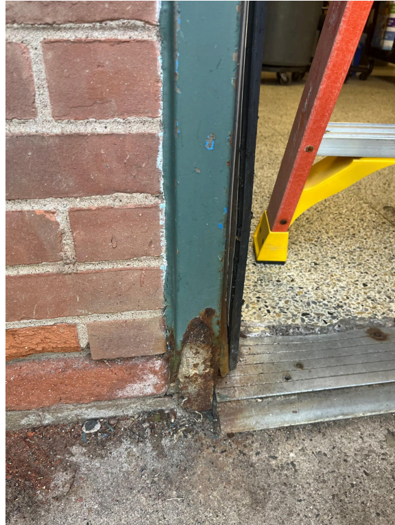
Bielefield kitchen door jam ^^