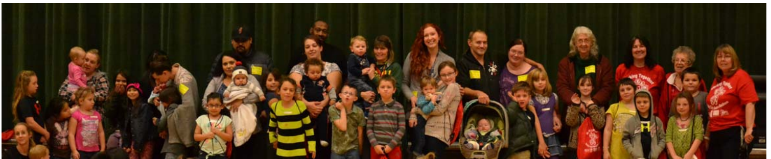
Families and students honored at December 4th, BEAR Project Assembly