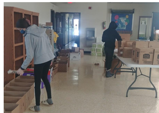
BPS Student Volunteers prepping food boxes