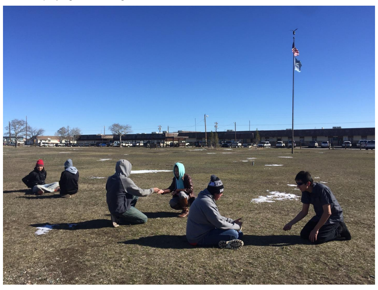
Students playing traditional games at All Chiefs Park