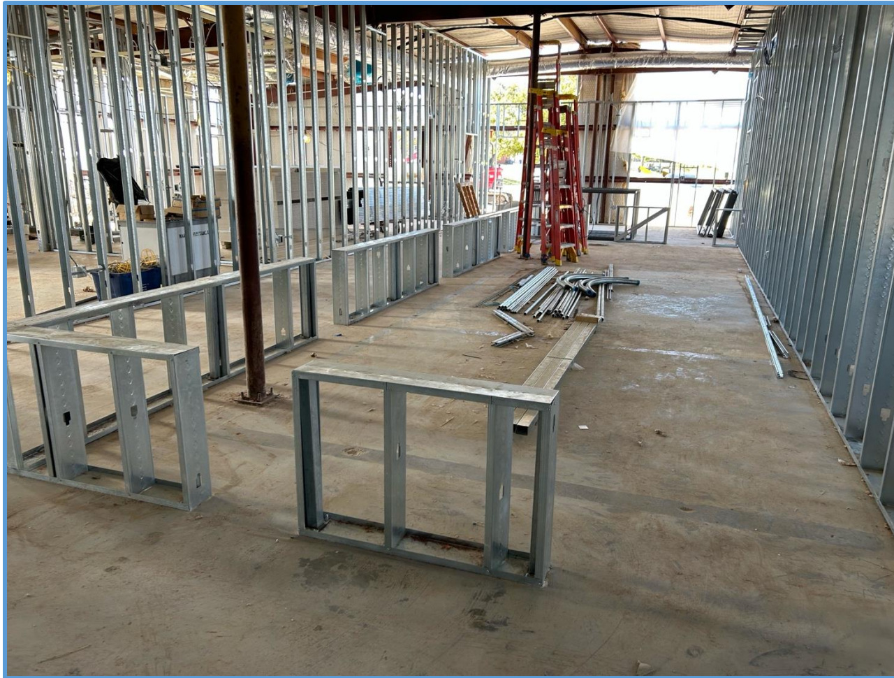
Paw Prints – Framing, Electrical, Duct