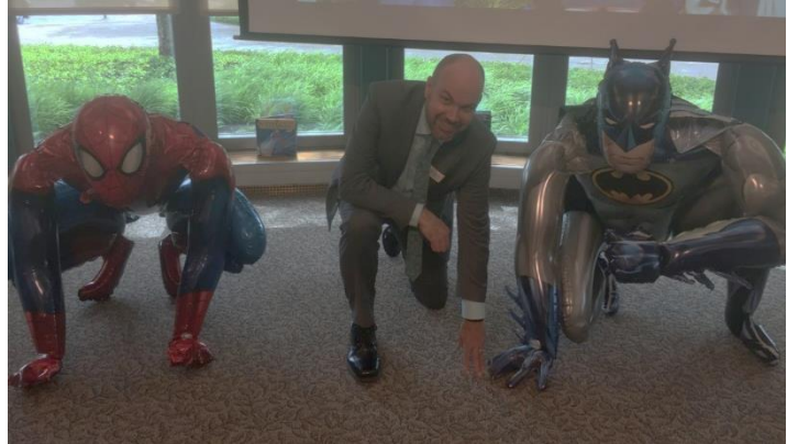
Our theme: Volunteers are Superheroes.

The library was also served in 2016 by 592 members of the Teen Library Council and Teen Volunteer Corps, who collectively gave 3,080 hours of service on various projects such as helping with summer reading programs, setting up for book sales, and preparing materials and mailings for special events.