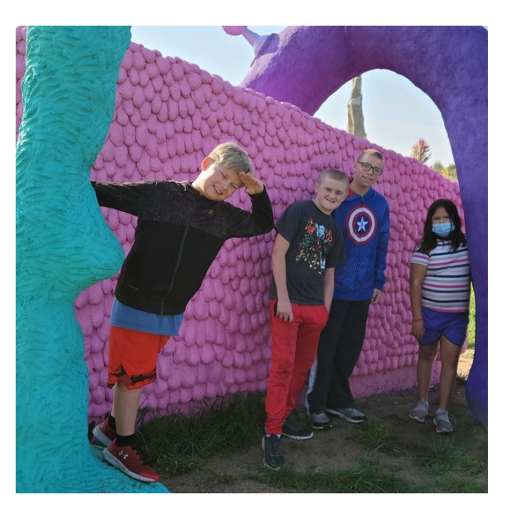
Kinship Kinskids explored Franconia Sculpture Park. October 2021