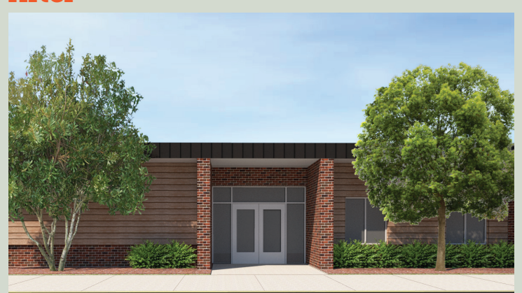
Conceptual Rendering of Anne Sullivan Elementary School with new windows, doors and siding.