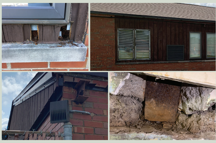
All District 23 schools are in need of exterior envelope repairs, including Anne Sullivan Elementary School pictured above.