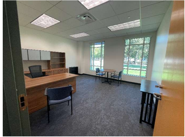
Office at F139