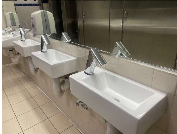
ADA Required Sinks at Heritage Hall