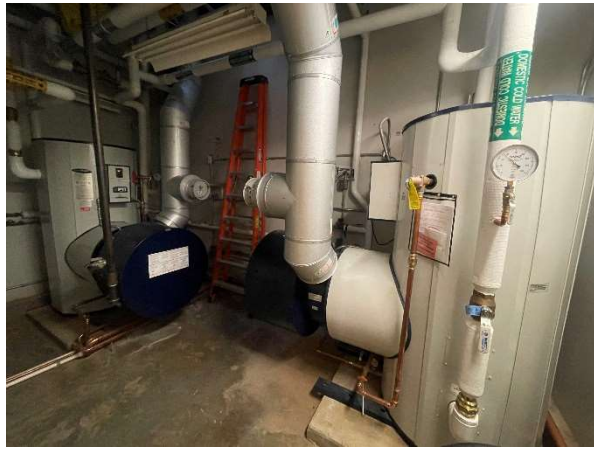
Boilers Installed for Culinary Arts