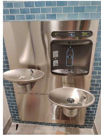
Bottle Water Filler Installed at Alumni Dining Hall