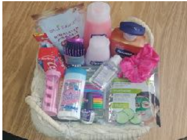
Teen Moms' gift basket