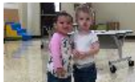
EARLY CHILDHOOD LEARNING CENTER