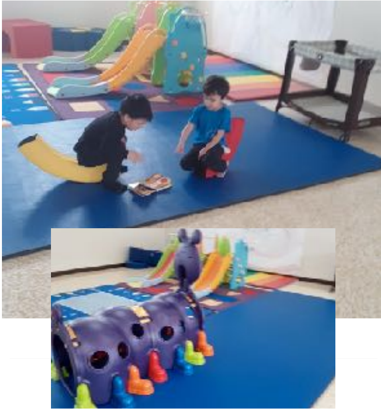
Big Room Play Space

The children are also enjoying the sporadic spring weather that allows them to get outside and run around. When the weather isn't so great, they are also enjoying their new indoor play space.