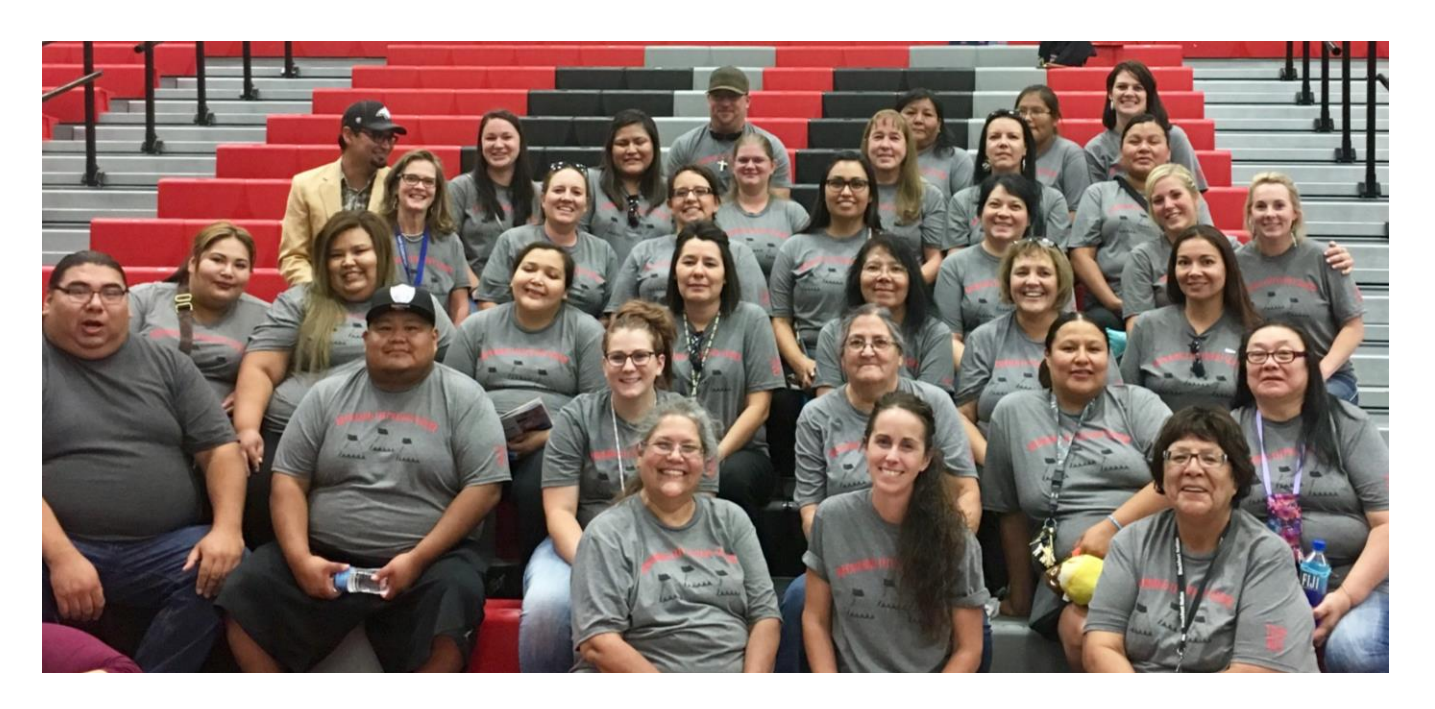
BES staff at Orientation