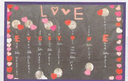
BLACK HISTORY MONTH BULLETIN BOARD