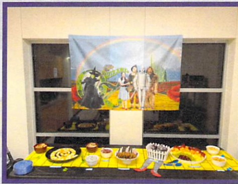
WIZARD OF OZ