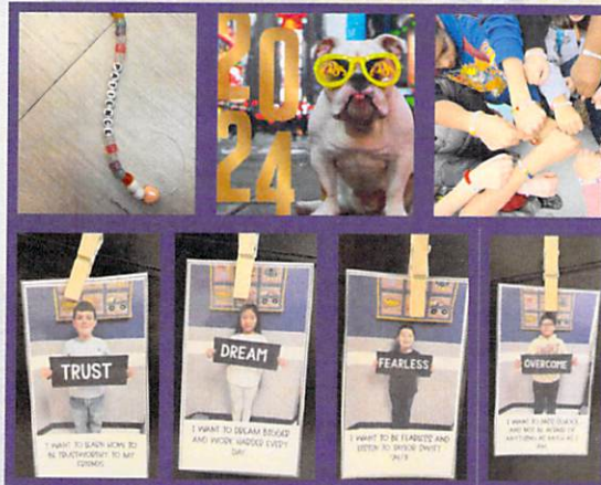
ONE WORD RESOLUTIONS