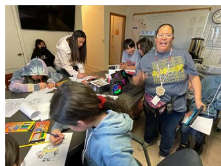
Students waiting for their turn to relax in the massage chair.