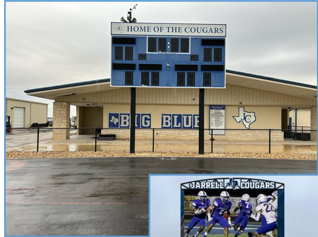
Cougar Stadium 2015 Scoreboard (part of turf project)