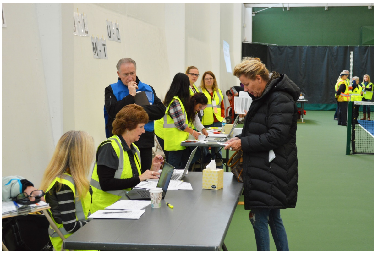
IT staff members check in a parent at the full-scale parent reunification exercise held on October 14, 2016