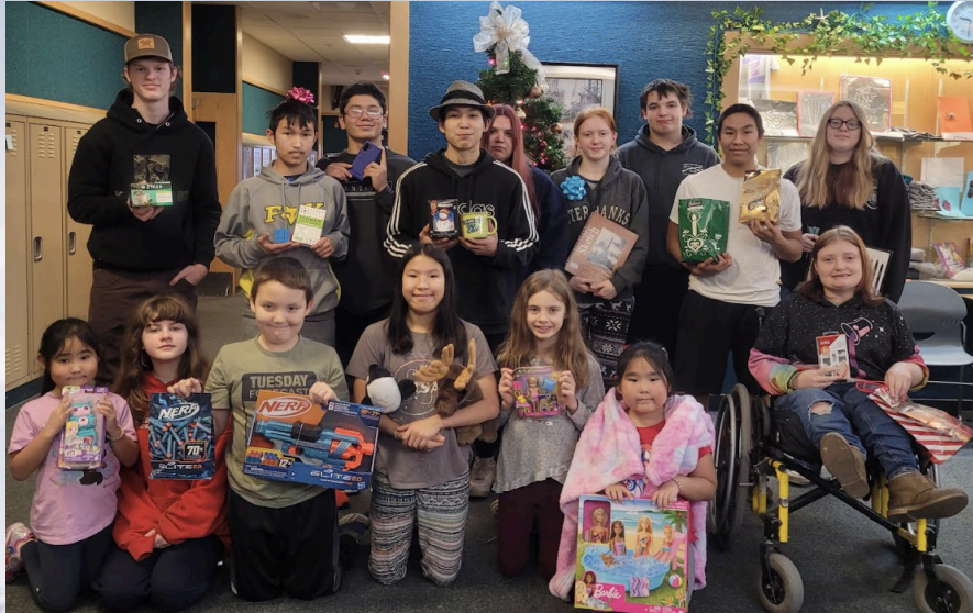
(Students Christmas at Naukati School)